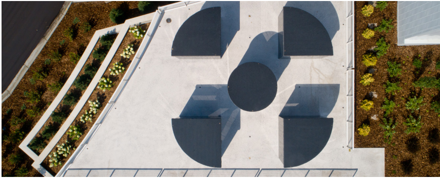
COLUMBARIUM DIAGRAM FROM LEFT TO RIGHT Faith, Grace, Love (middle), Hope & Mercy